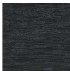
Colossal 33496 LRV 3.3